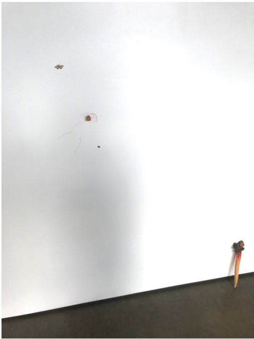
Out And About (Moth W/Others) , mixed media, sizes variable, 2019, price upon request