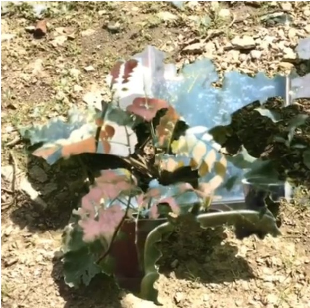
May/22/19, Inauthentica , Video (Color, no sound), 35 seconds, 2019, NFS