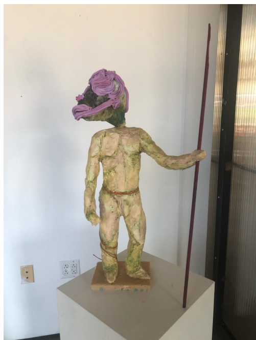
Guardian For Skipping High School