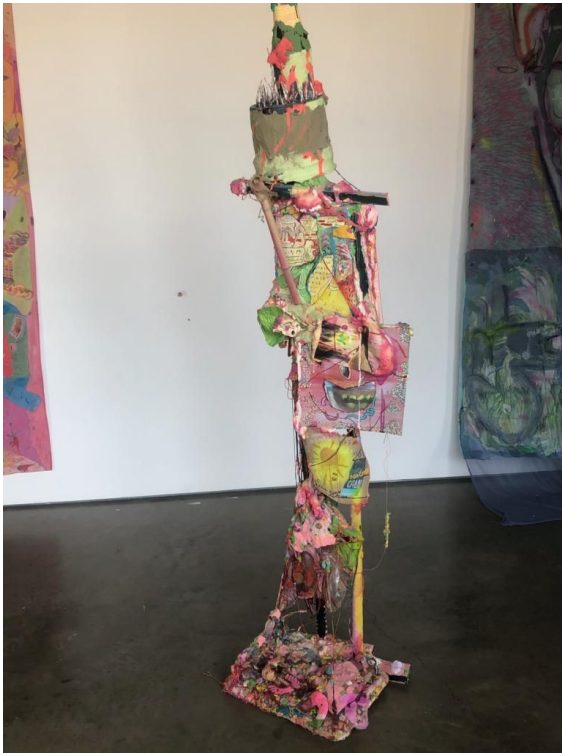
Practicing To Be An Endothermic Tree (Revision 4) , lucky charms, aluminum, wood, twine, acrylic, polyurethane, spray paint, insulation foam, plastic cups, duct tape, ink, iron, flamingo floaty etc., 2017-19, 8'x2'x3', $650