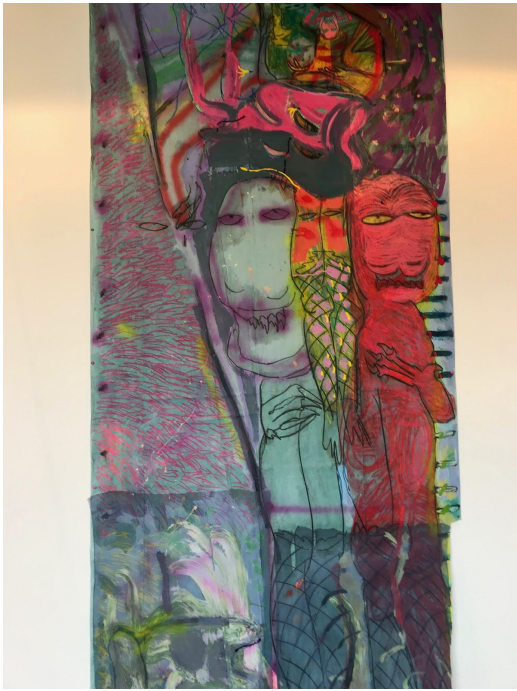
Painting For Being Unmade Acrylic, pastel, ink, cotton netting and spray paint on tyvek, 2018 149"x48" $3,000