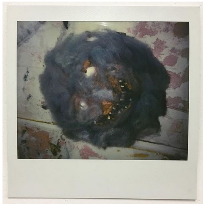
Abundant Steady State , polaroid, 2019, $240