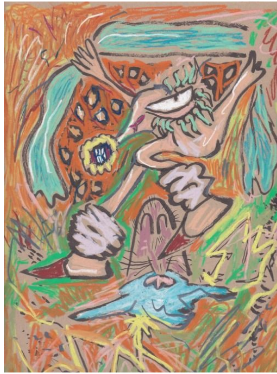
<-^->~*~<-^->vwvwwv, pastel on paper, 2017, $260