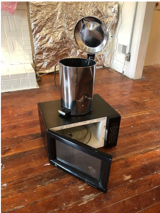
A COLLECTION OF FOUND TIME CONTROLLERS Found object sculpture $450