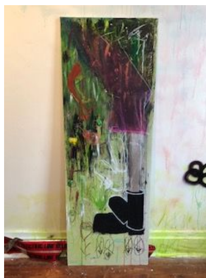
RED AND BLUE IN THE GARDEN / BIG BOOT ASS Mixed media on drywall $1,350