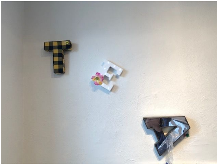
TEA IS FOR EVERYONE Found object sculpture $400