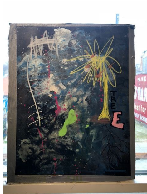
UNTITLED Mixed media on drywall $750