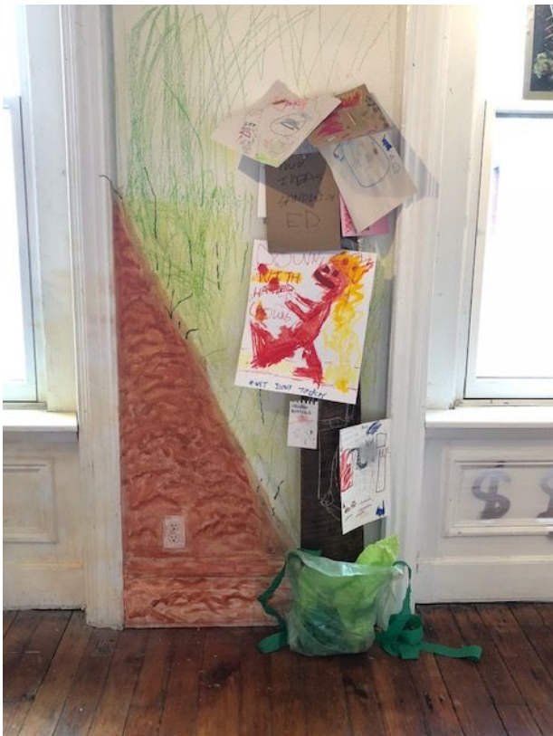
SIGNS OF STREETS APPROACHING Mixed media drawings on found lumber $1,350 (for complete collection) First 5 Drawings sold: $75, Second 5 sold: $100 Third 5 sold: $150 Fourth 5 sold: $200 TALLY: