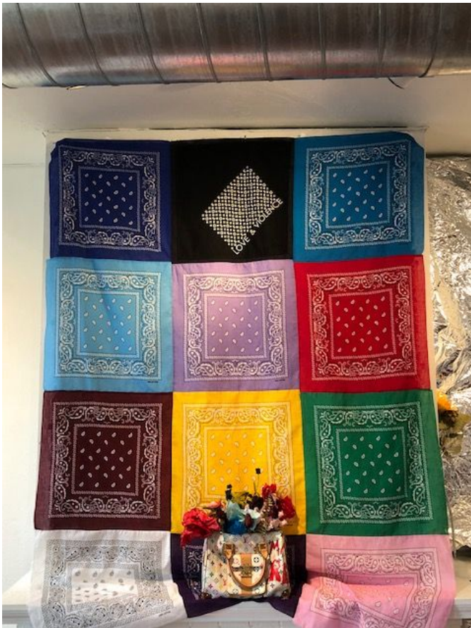
PEACED & LOVE SCARF Wearable found object sculpture $500