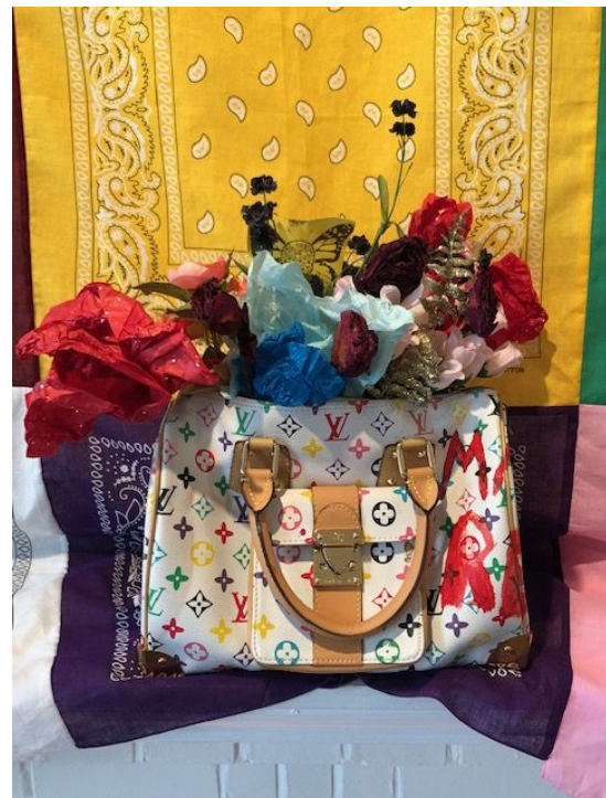
MAYBE REAL LV BAG Wearable found object sculpture $2,000