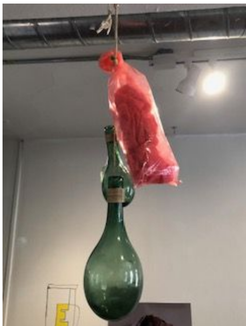
Kissing under the scrotum of growth Found object sculpture $400