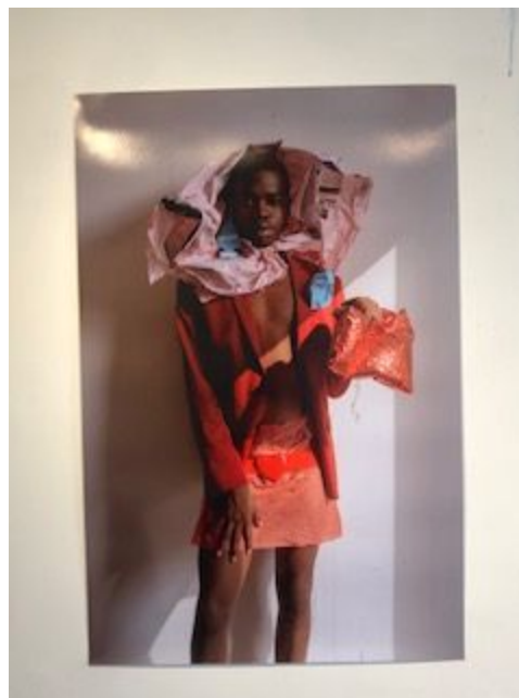
BARBIE SELF PORTRAIT POSTERS Oil pigment on synthetic fabric $700 Edition of 3