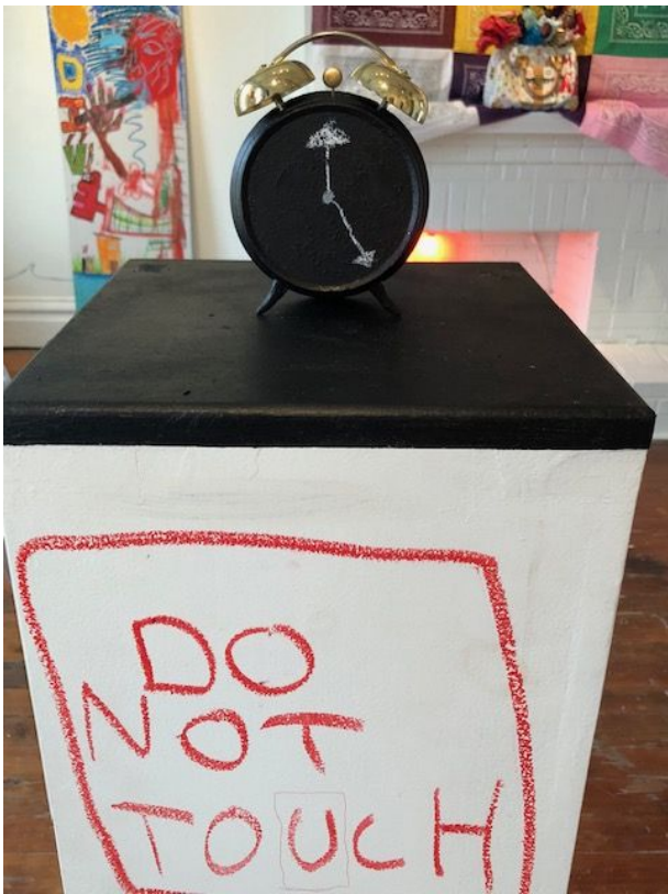
COLORED PEOPLE TIME Found object sculpture $400