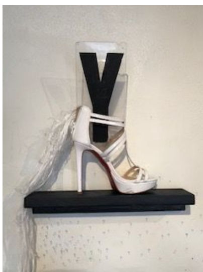
Y-T SHOE Found object sculpture $400 shoe $450 (includes shelf)