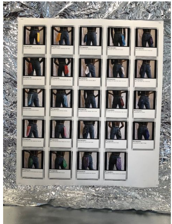
HANKY CODE PLAYING CARDS Oil pigment on synthetic fabric $350 (full sheet, comes with cutting instructions)