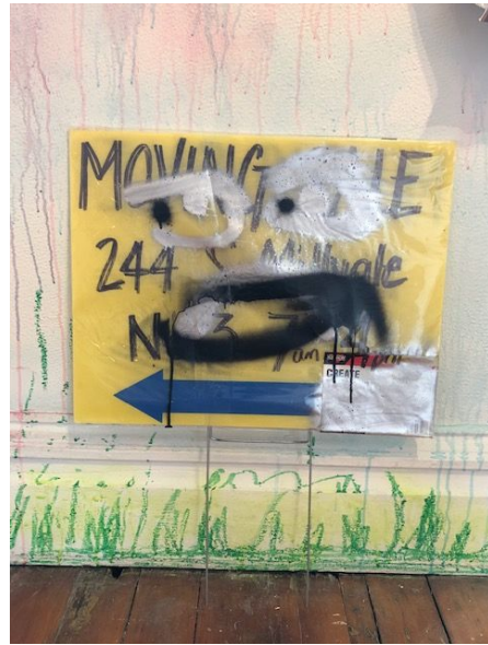
SPONGEBOB ON MOVING DAY Mixed media on found object $400