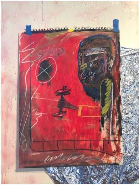
A STRUGGLE BETWEEN CHILD & THE PASTS' FUTURE Mixed media drawing on paper $700